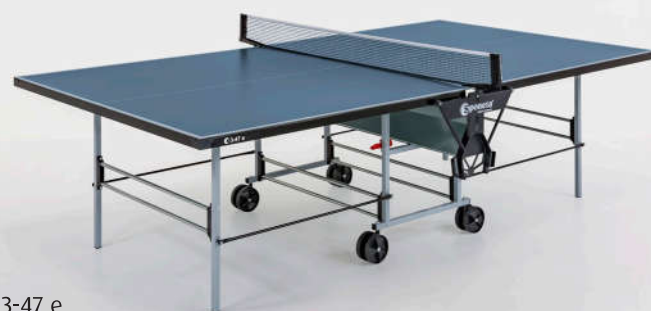
S 3-47 e

1) for outdoor melamine resin boards according to our warranty terms