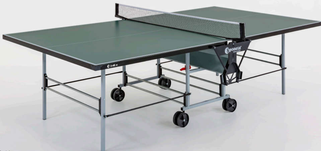
S 3-46 e